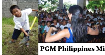
PGM Philippines Mission '07